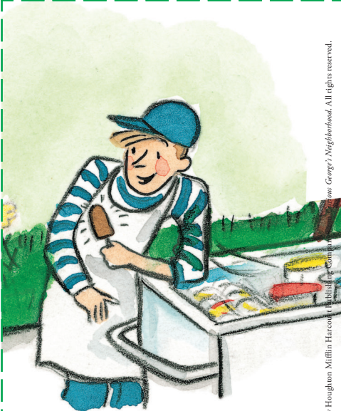
Ice cream vendor

Illus. © 2003 by Houghton Mifflin Harcourt Publishing Company from Curious George's Neighborhood . All rights reserved.