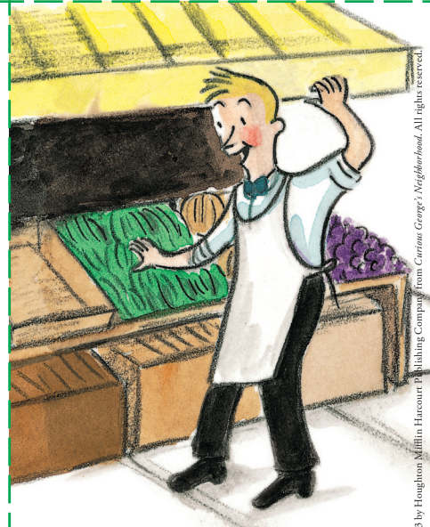
Grocery store worker