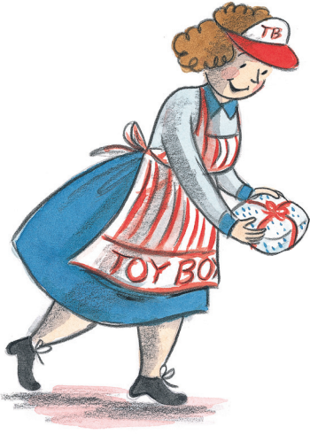
Toy store worker

Illus. © 2002 by Houghton Mifflin Harcourt Publishing Company from Curious George Visits a Toy Store . All rights reserved.